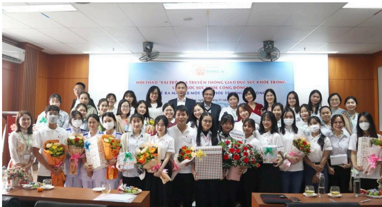
Launching ceremony of OHSC at Dong An University.

VOHUN arranged a two-day course for 37 One Health in-service professions at One Health Sites in Can Tho from 30-31 March 2023. The participants worked in the Can Tho and Long An CDC, DAH, sub-DAH, district health centers, animal health stations, Department of Agriculture, and regional universities. The training focused on the One Health approach, One Health core competencies, identifying priority One Health problems, and facilitating students’ development at OHS.