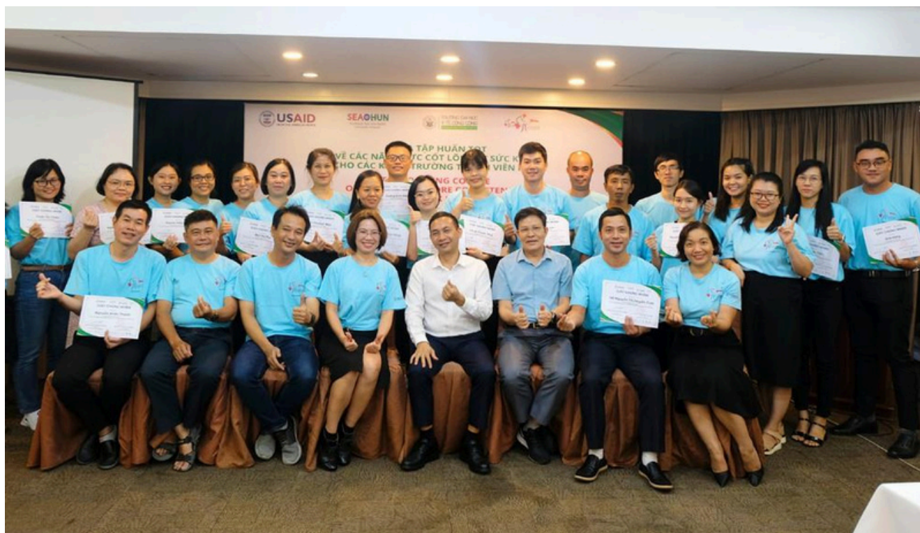
Launching ceremony of OHSC at Dong An University.

The VOHUN NCO conducted an alumni tracking survey on Kobo toolbox, tailored for Public Health graduate students with a One Health focus for the international master's degree program at the Institute of Preventive Medicine and Public Health (IPMPH- HMU). We collected valuable insights regarding the status and post-graduation experiences of our alumni. Out of 120 alumni who received the questionnaire, 74 participants completed the online survey. We gathered the primary data from 28 July to 15 August 2023.