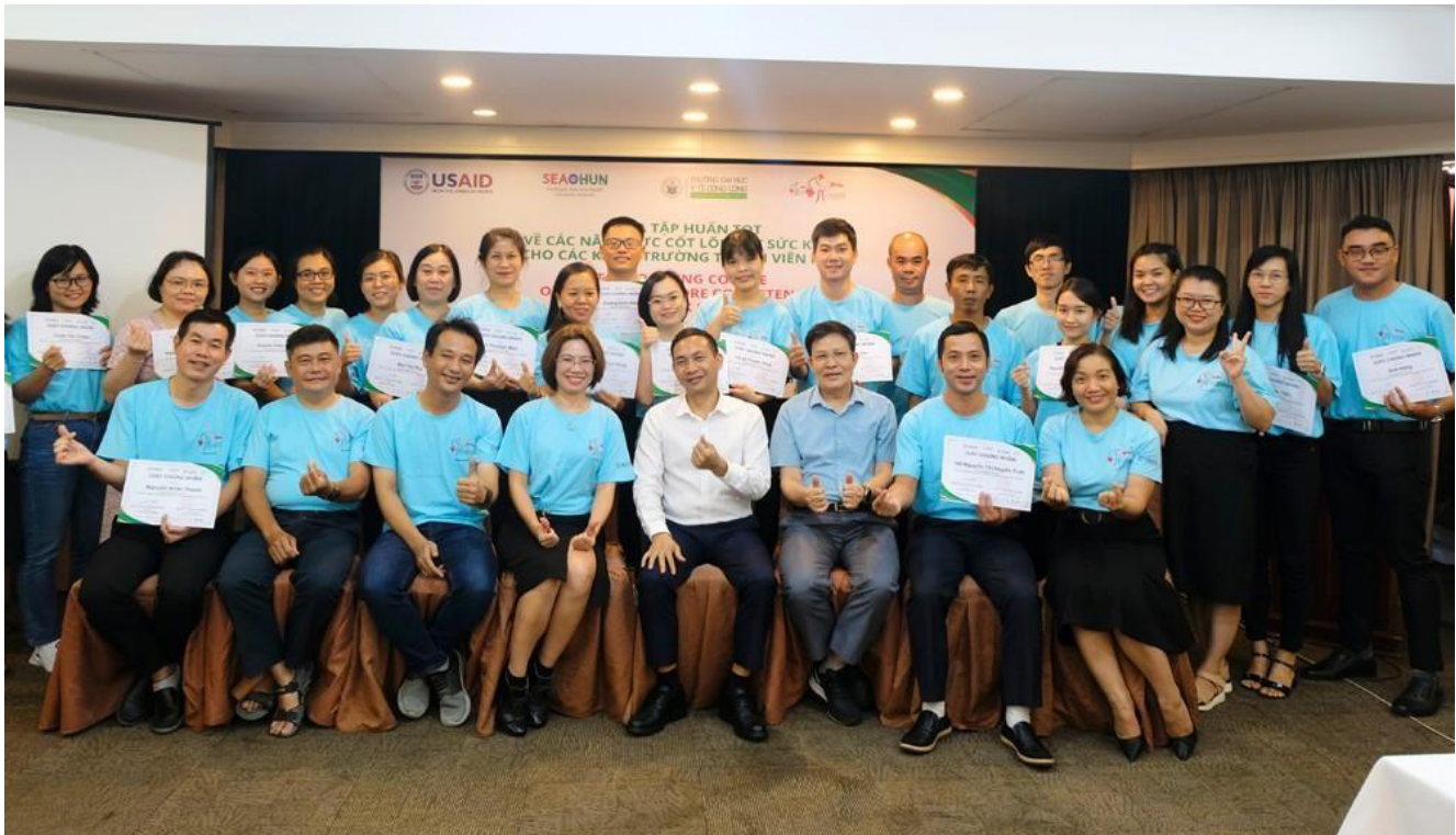
Launching ceremony of OHSC at Dong An University.

The VOHUN NCO conducted an alumni tracking survey on Kobo toolbox, tailored for Public Health graduate students with a One Health focus for the international master's degree program at the Institute of Preventive Medicine and Public Health (IPMPH-HMU). We collected valuable insights regarding the status and post-graduation experiences of our alumni. Out of 120 alumni who received the questionnaire, 74 participants completed the online survey. We gathered the primary data from 28 July to 15 August 2023.