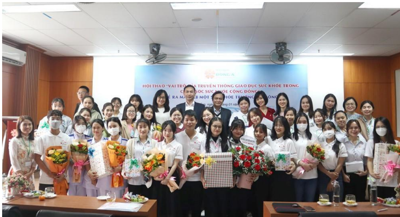
Launching ceremony of OHSC at Dong An University.

VOHUN arranged a two-day course for 37 One Health in-service professions at One Health Sites in Can Tho from 30-31 March 2023. The participants worked in the Can Tho and Long An CDC, DAH, sub-DAH, district health centers, animal health stations, Department of Agriculture, and regional universities. The training focused on the One Health approach, One Health core competencies, identifying priority One Health problems, and facilitating students’ development at OHS.