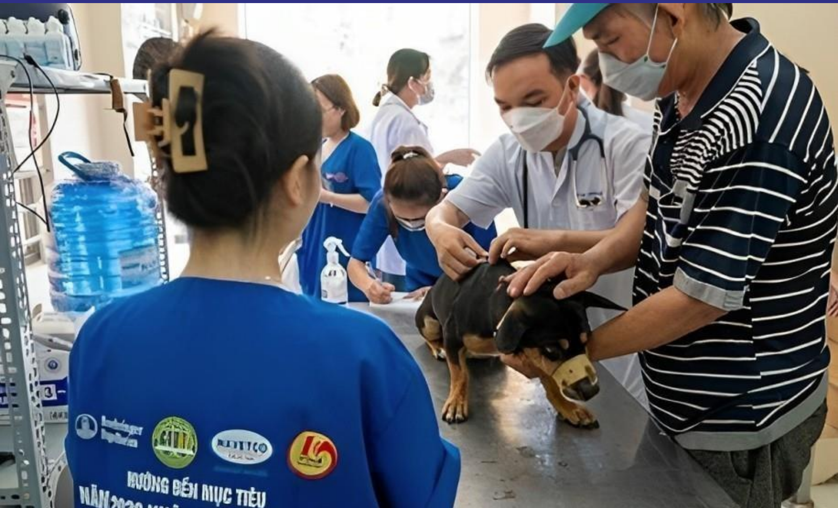
Students learning examination and rabies vaccination for dogs and cats in Duc Hue, Long An.