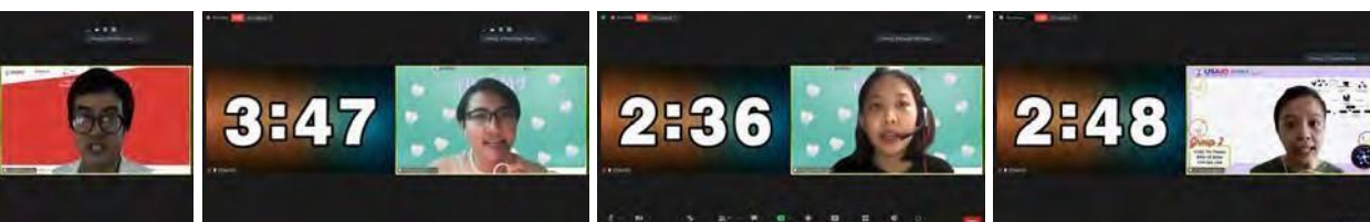
Students compete in the debate hosted by VOHUN on their 10th anniversary, 30 August 2021.

From April to July 2021, to explore the current situation of KMS in VOHUN member