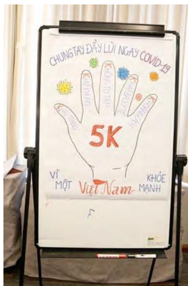
Workshop participants practice their skills at communicating how to properly wash hands.

The Vietnam One Health University Network (VOHUN) developed a three-day training workshop for health professionals, conveying knowledge and core principles of risk communication, and fine-tuning skills to design communication materials and develop communication plans.