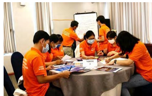
Laboratory technicians in South Viet Nam learning biosafety and biosecurity, 23 November 2020.

From September 2020 to September 2021, qualified lecturers from VOHUN conducted a quantitative survey with participation from 283 laboratory workers from VOHUN member Universities, provincial CDCs, SDLAHs, and other partner laboratories. In addition, 50 in-depth interviews with leaders of these labs and leaders of provincial levels in human and animal health fields were also conducted. The objectives were to identify the current biosafety and biosecurity practices of