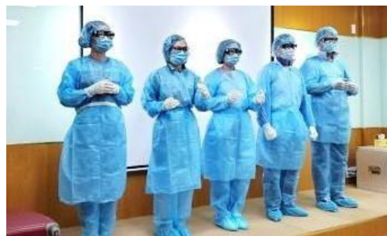
Personal protective equipment, distancing, and group size standards in this photo were consistent with local public health guidance and COVID-19 status in the specific country and time it was taken. This may not reflect best practices for all locations where COVID-19 is still spreading.

Finally, to ensure the continued training of health care workers, veterinary staff, and students, the VOHUN NCO hosted a workshop to develop a virtual training program (VN Activity 1.3.1). This 8-course training program aims to assist health workers and veterinary staff in developing and implementing zoonotic disease prevention plans within a One Health framework. A total of 51 faculty helped develop the training content which focuses on zoonotic disease prevention and the application of One Health core competencies. Three hundred ninety individuals from VOHUN member universities and Viet Nam governmental departments participated in interviews to assess the need for further training on laboratory biosafety and biosecurity.