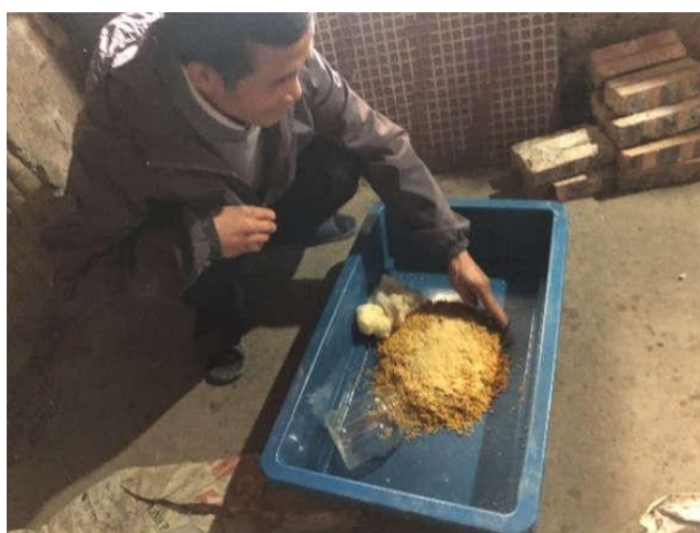
OHSC members demonstrated how to breed black soldier fly larvae and manage organic waste.