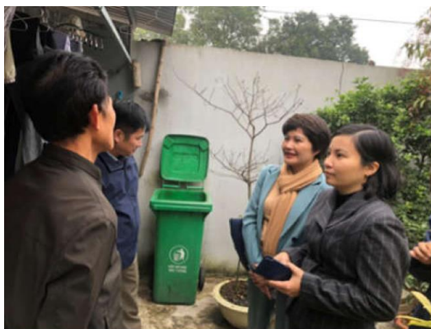
Experts and local authorities visiting the community to provide guidance on waste management.

The enthusiastic support and active participation of the local authorities and community fueled the success of the campaign. This conducive environment enabled students and club advisors to effectively reach out to the community, facilitating interactive sessions on waste classification and sustainable practices at local cultural centers and individual households. This campaign not only yielded positive results, but also opened up opportunities for a more sustainable living environment for current and future generations in Viet Nam.