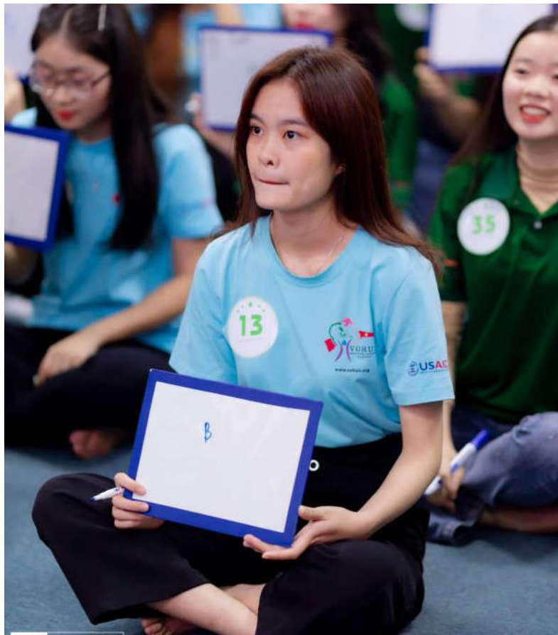
Students from Vinh Medical University and Nghe An University of Economics participating in the OH awareness event.