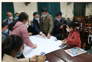
Picture 2: Health and veterinary staff in the "On applying One Health core competencies to develop the zoonotic diseases prevention plan for health and veterinary"