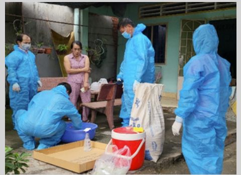
TIP-2: A comprehensive approach to improving waste management, handling, and processing on wildlife farms (priority given to civet and bamboo rat farms).