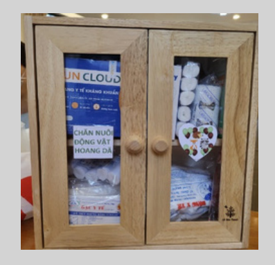
TIP-3: Improved biosafety and biosecurity through health care, disease control and disease surveillance for farmed animals