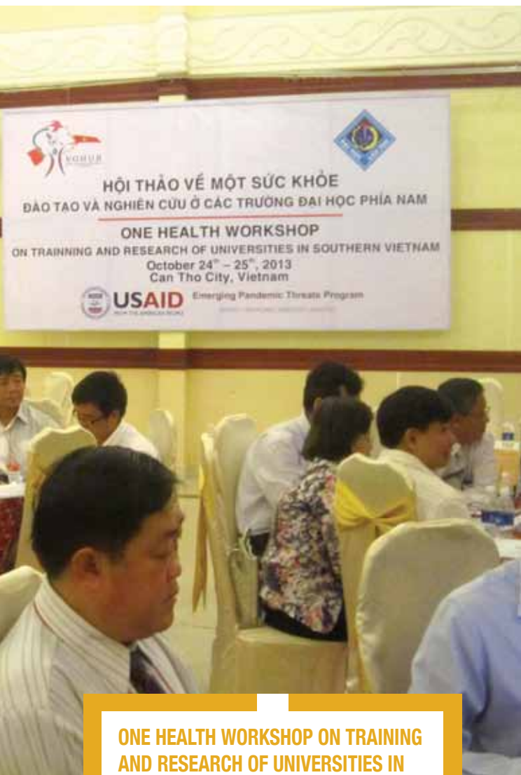
ONE HEALTH WORKSHOP ON TRAINING AND RESEARCH OF UNIVERSITIES IN SOUTHERN VIETNAM, CAN THO, OCTOBER 24-25, 2013

The OH workshop was held involving multiple faculties in Southern Vietnam to discuss and strengthen understanding of OH and the OH approach to control emerging infectious diseases. The workshop was part of an effort to facilitate coordination of One Health curriculum development within a regional network in Vietnam. Under tight collaboration between VOHUN and Can Tho University, the organized workshop aims to introduce One Health's knowledge on training and research of universities in Southern Vietnam and to extend the One Health network in both Medical and Veterinary universities, colleagues and institutes in this region. The target audiences of the workshop were lecturers/ researchers/ government staffs of institutions, government organizations which offer programs of human medicine and veterinary in Vietnam or involve in zoonotic diseases prevention.